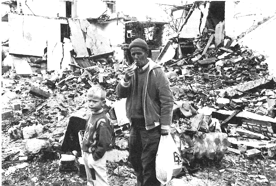
A Muslim man and his grandson stand amid the destruction in Stari Vitez.