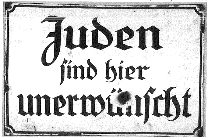
A sign reading "Jews Are Unwanted Here."

to German domination in Europe. As he gained more and more supporters throughout Germany and elsewhere in Europe, already present anti-Semitism drastically increased.