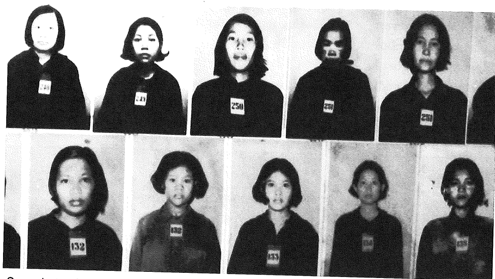
Snapshots of genocide victims taken before their execution at Tuol Sleng Prison in Phnom Penh—the Khmer Rouge’s largest torture and killing center.