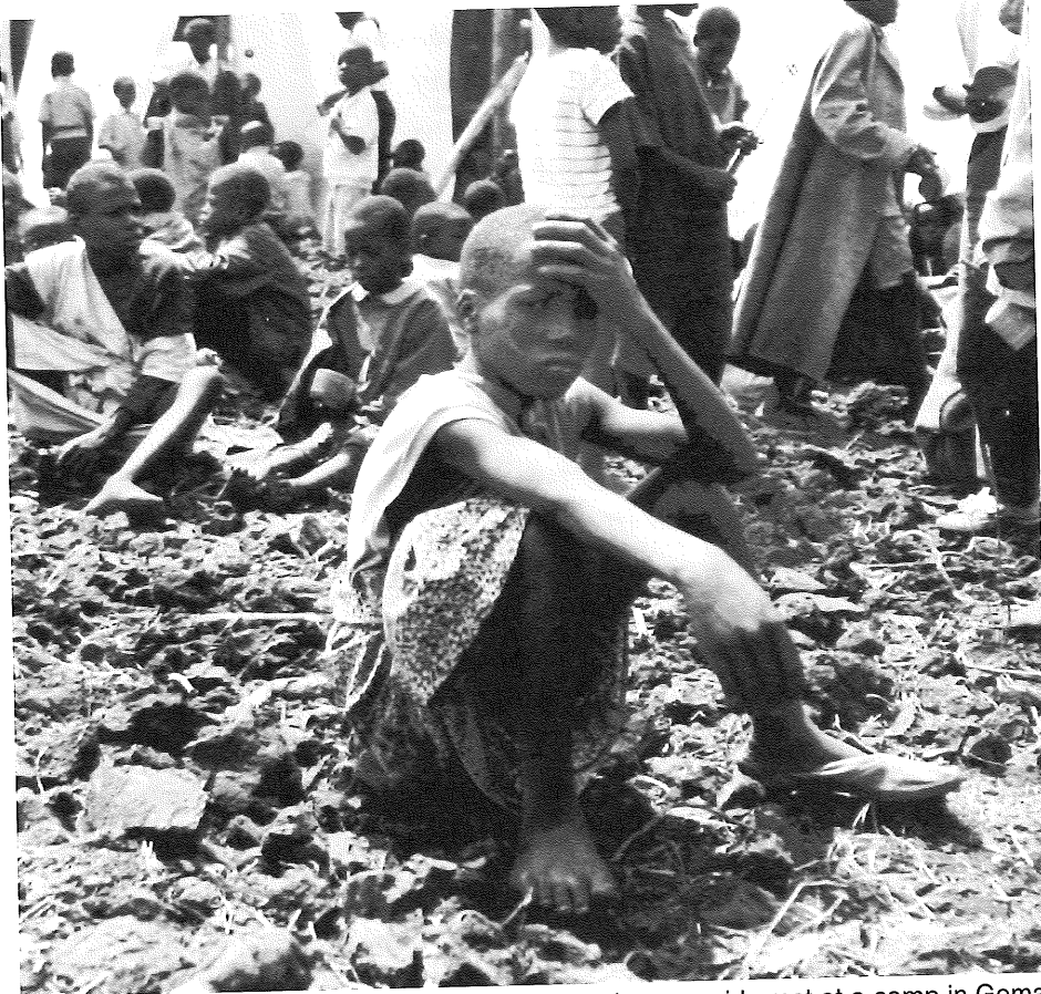
Rwandan children who lost their parents in the genocide rest at a camp in Goma.

Reprinted with permission.