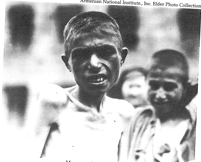
Young victims of the Armenian Genocide.