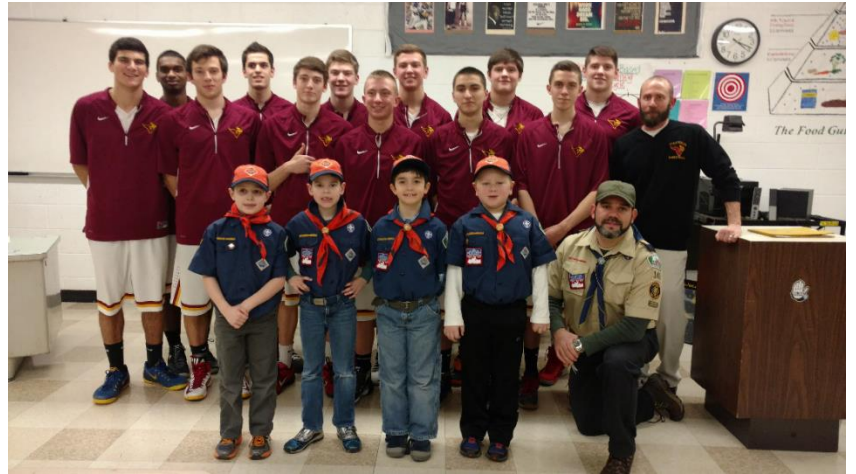
Photo: Cub Scouts with Team