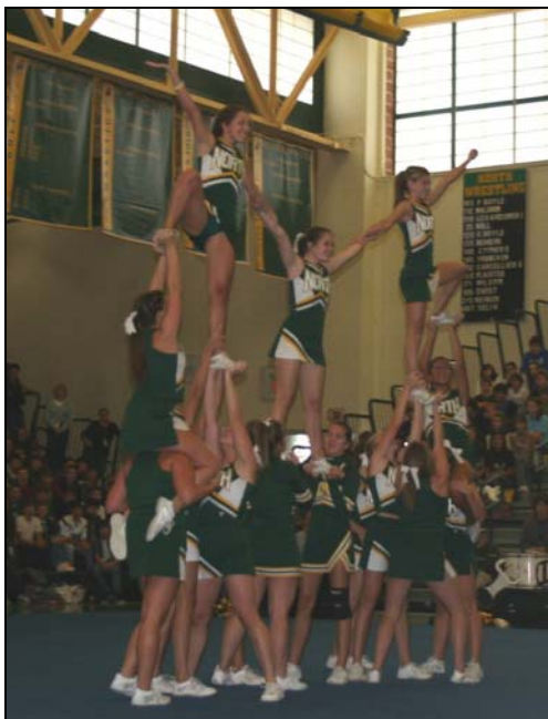
The Varsity Cheerleading squad gets the crowd pumped up with its impressive pyramid.

The Homecoming court of eight girls and eight boys then took center court to perform a rehearsed skit to “Grease Lightning”, which brought