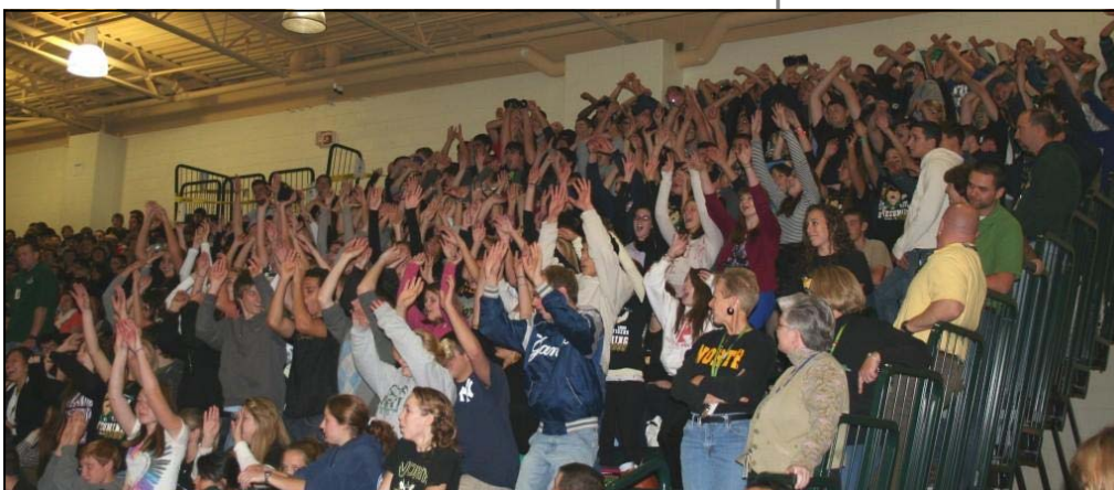
Left: The senior class shows the rest of the student body how the wave should be done.