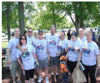
Somerset County Walk for a Difference June 9, 2013 Bridgewater Raritan Middle School