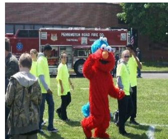
Mercer County Walk For A Difference May 11, 2013 Ewing High School