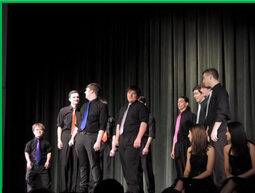
The men of Show Choir, December 2014