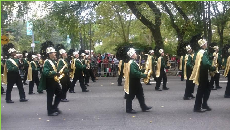
Columbus Day Parade, NYC October 2014