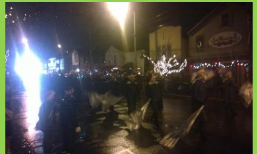
December Parade, Clinton 2014