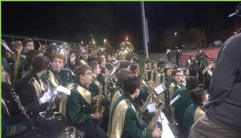
In the stands at a football game, Fall 2014