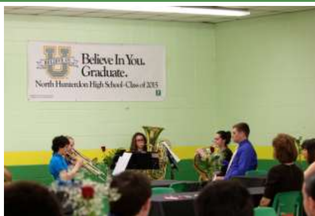
The Brass Ensemble entertains at Spring Banquet.

Group id number: 22NORHHS (for us to get credit)