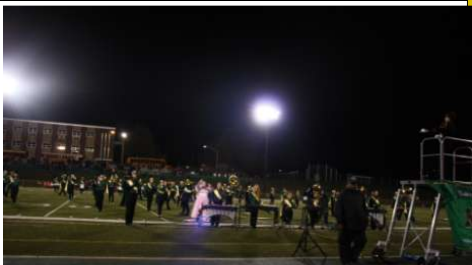
The Marching Band performing their halftime show "Wicked" 2013.