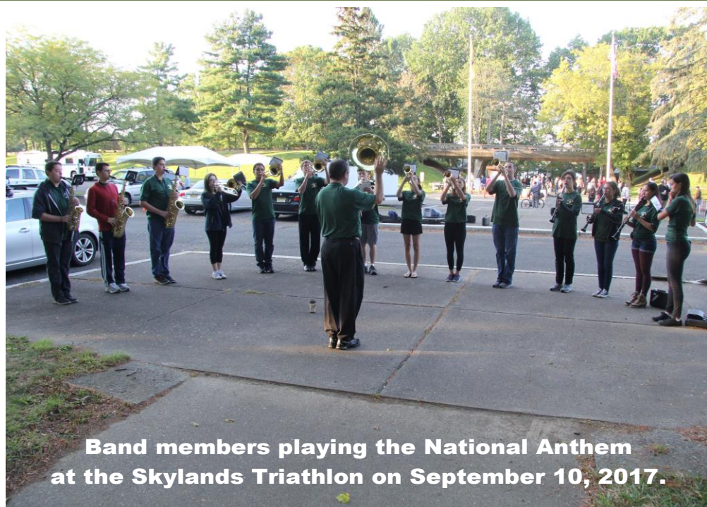
Band members playing the National Anthem at the Skylands Triathlon on September 10, 2017.