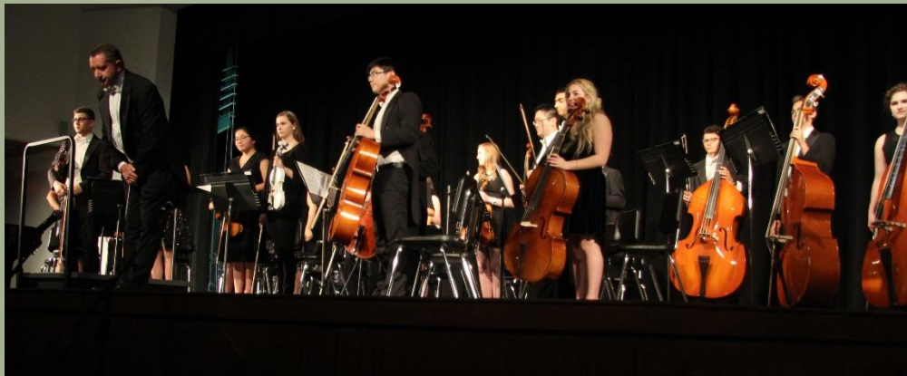
Orchestra (top), Show Choir (below), and Jazz Band (to right)