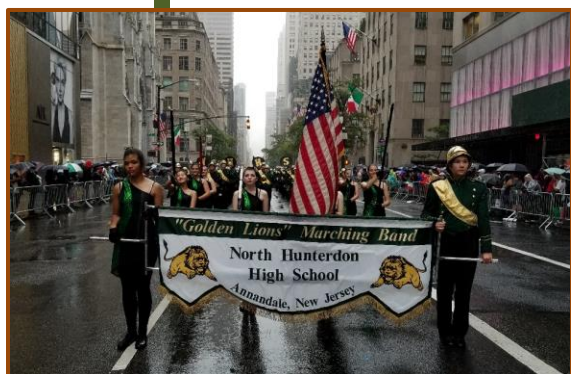
The "Golden Lions" performing on on 5 th Ave.