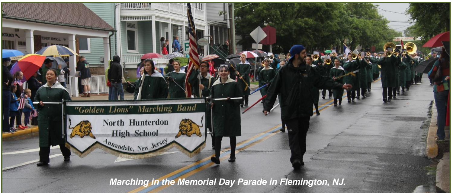
Marching in the Memorial Day Parade in Flemington, NJ.