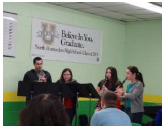
Music students performing at the Marching Band Banquet