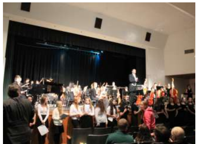
Winter Concert Finale with all Groups