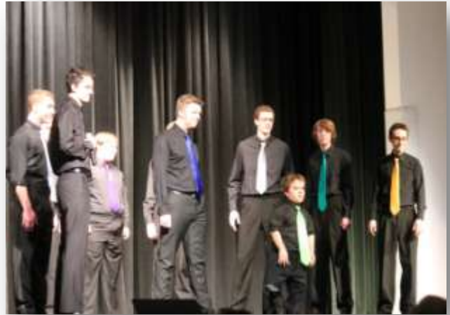
The Boys of Show Choir