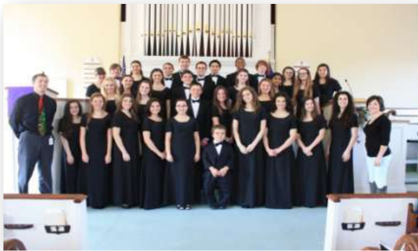
Show Choir and Chamber Choir at Bethlehem Presbyterian Church

The above schedule is also on the 'Music Department' portion of the NHHS website.