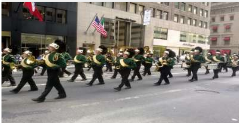
Marching Band in Columbus Day Parade NYC