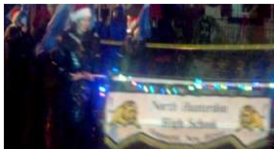
Marching Band at Clinton Christmas Parade