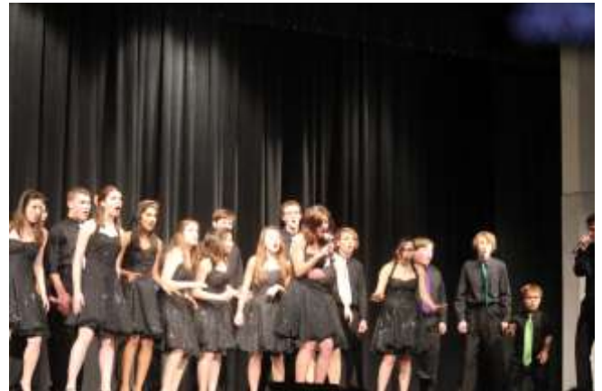
Show Choir Performs Under the Direction of Ms