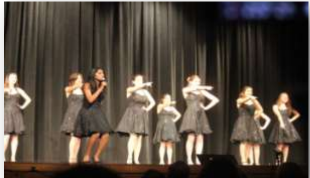
The Girls of Show Choir