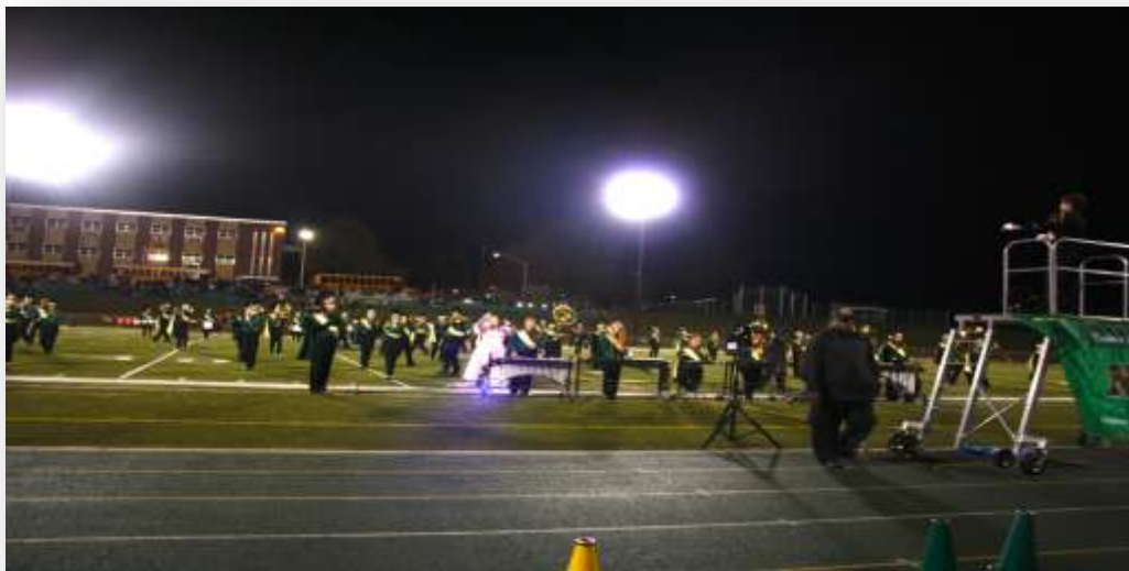
Marching Band performs "at Homecoming Halftime Show