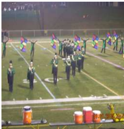
Marching Band on the field at Band Festival in Phillipsburg