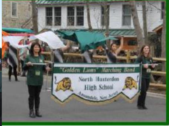
St. Patrick's Day Parade, Clinton 2016