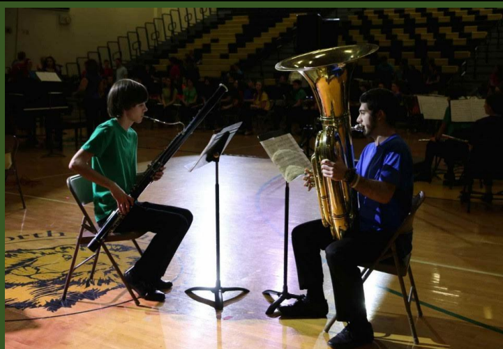
PRISM Duet 2016