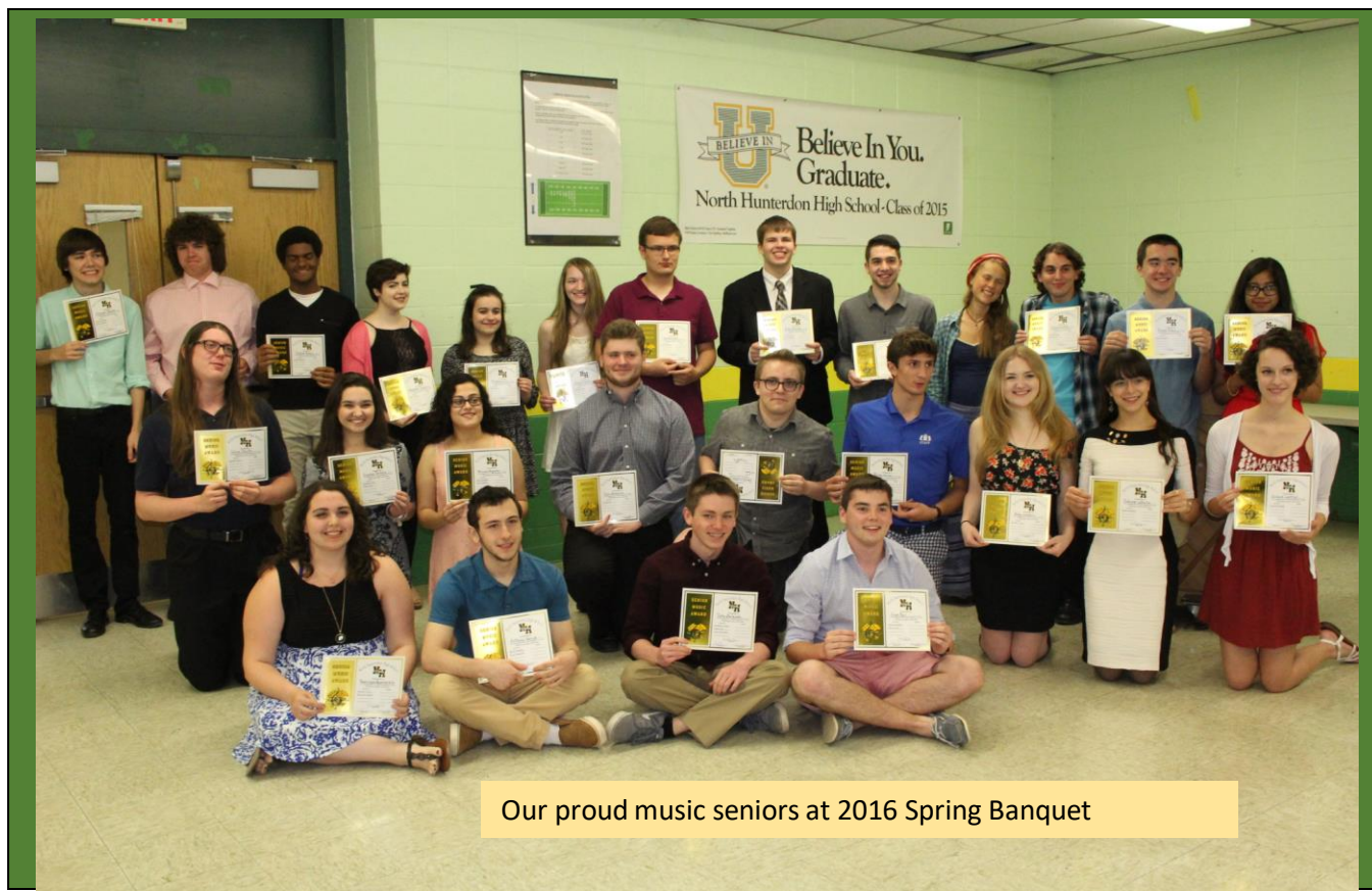
Our proud music seniors at 2016 Spring Banquet

Membership is $20 per family. First-time members receive an NHMA car magnet, a $5 value, for FREE!