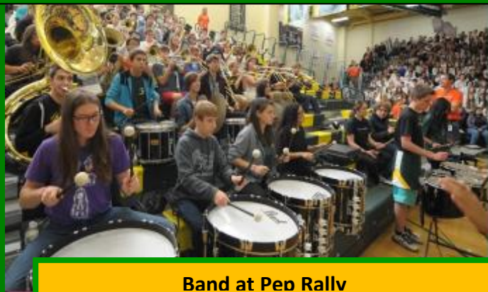
Band at Pep Rally