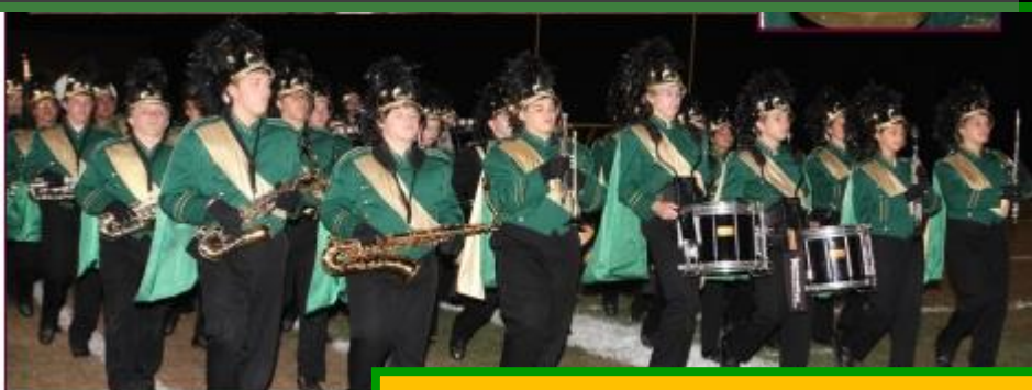
Golden Lions at the Milk Can Game