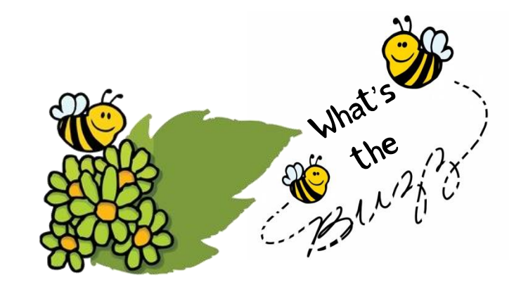
Monthly E-Notes ~ May 2016