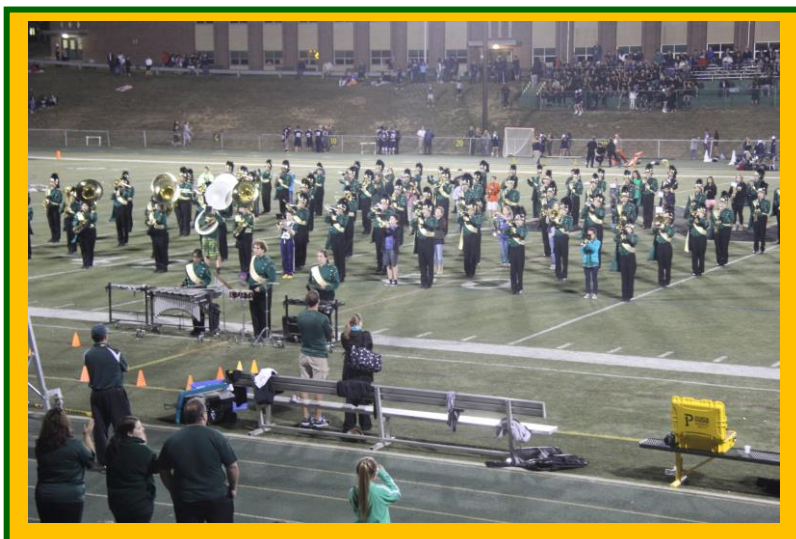
7 th and 8 th Grade Band Night