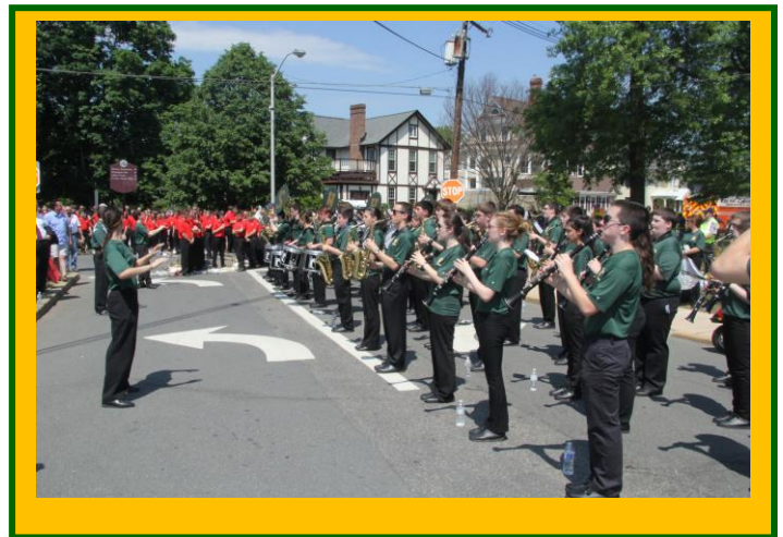
St Patrick's Day and Memorial Day Parades