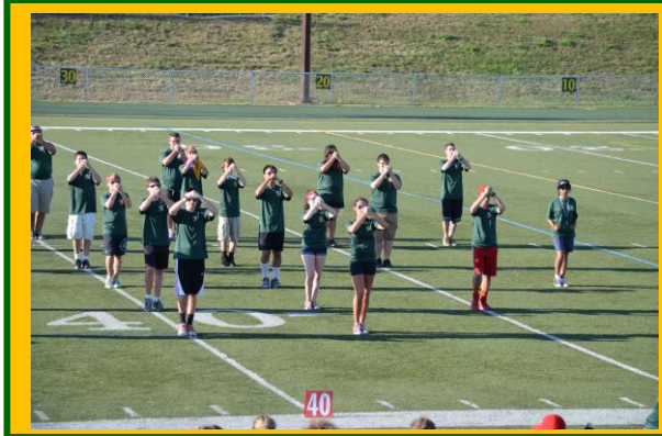
Band Camp 2015