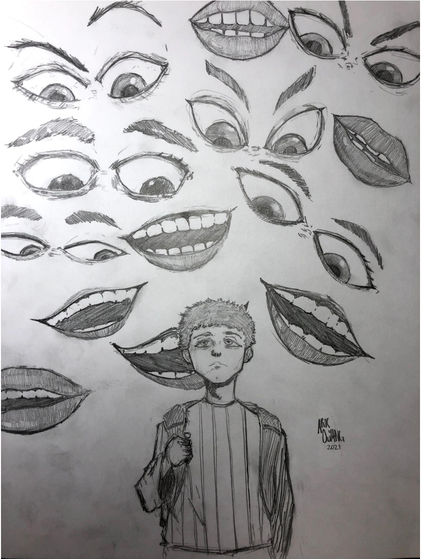
Kitai Ark OuYang